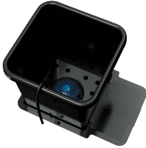
AirBase Square fits AutoPot 8.5L and 15L plastic pots as used in 1Pot modules (pictured) and easy2grow modules

DESIGNED FOR EASY OPTIONAL INTEGRATION WITH AIRDOME