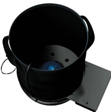
AirBase Round fits AutoPot 25L plastic and 20L fabric pots as used in XL and XL FlexiPot modules