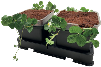
Fits 8.5 L / 2.2 gal pots as used in easy2grow modules (pictured above)