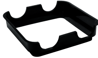
1x Strawberry Topper